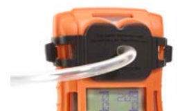
Bump/calibration plate To apply test gas to T4