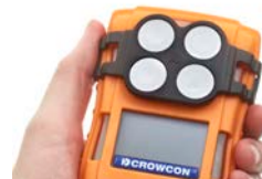
External filter plate Clip-on filter for dusty environments