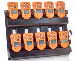
10 way charger For charging and storing your T4 fleet