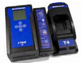
I-Test Easy automated bump testing and calibration solution