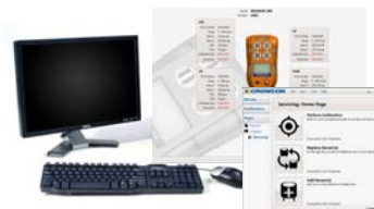
NEW Portables Pro 2.0 Software For easy configuration and servicing