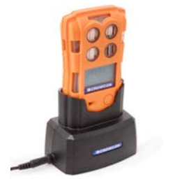
Cradle charger Docking station for easy charging