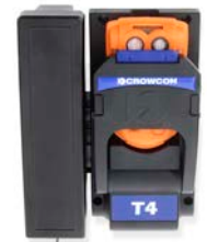
Vehicle charger Effective charging and storage whilst travelling