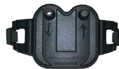
Aspirator plate Sample atmosphere prior to entry